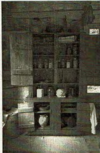
19 th C. Stepback Cupboard