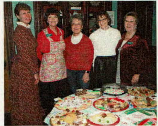
Mill House Guides and Volunteers

We'll have flyers about our events at meetings and events but the best advertising of our beautiful park is YOU! Give flyers to your neighbor and relatives; bring friends out to our events.