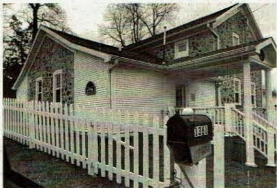
The Friess homestead stone home still stands today. It remained in the Friess family for 126 years – five generations.