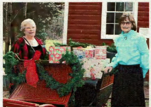
Mill House Committee Chairs