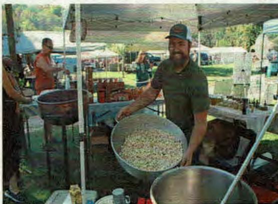
Preparing the Goodies

We're already planning next year's show. It will have some unique challenges due to Hwy. 164 road construction. We've been in touch with WisDOT regarding all of our events and will be continuing to work with them to minimize the traffic and access issues.