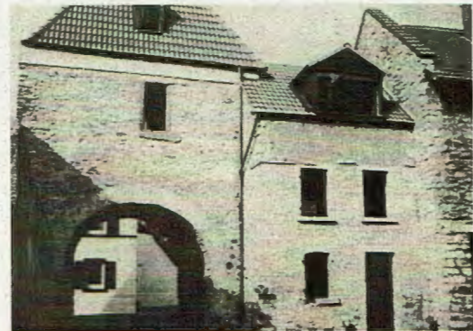
Friess Ancestral Home in Germany