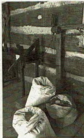
Grain & Feed Scale