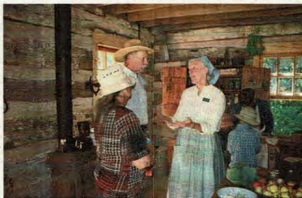
Visiting at the Pioneer Homestead