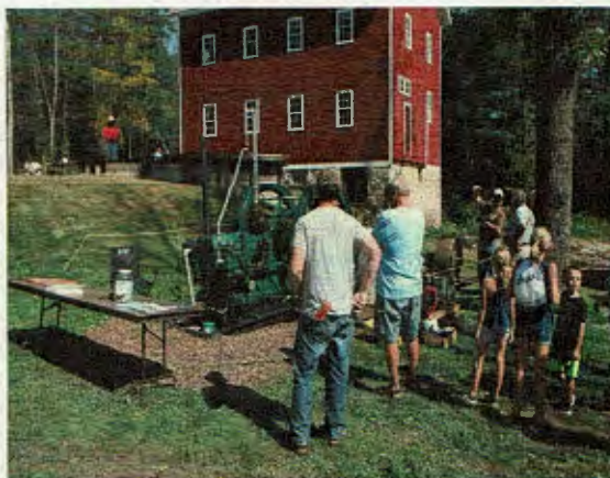
Inspecting the Superior Engine