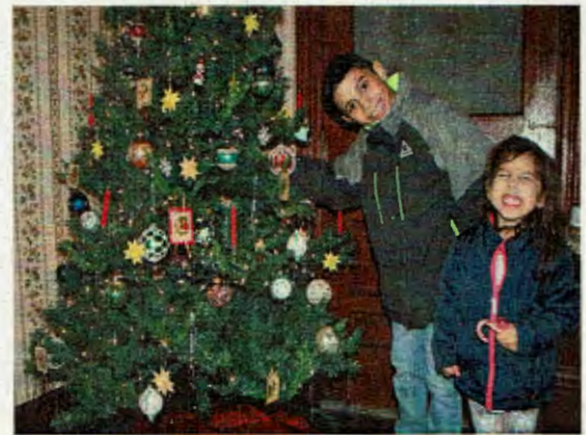
Finding the Pickle on the Tree